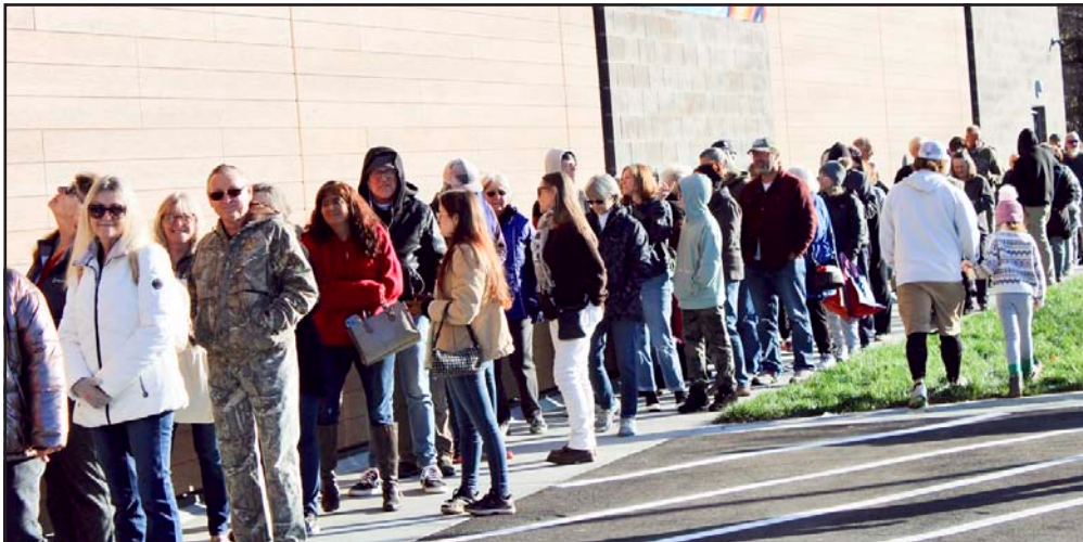
The turnout for the ALDI Grand Opening last week was phenomenal, with lines stretching around the backside of the building, even after the doors finally opened.